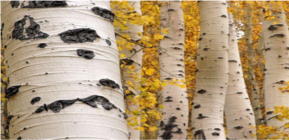
Aspen/Birch trees in Autumn from the National Geographic website

As we continue into Autumn 2013, I find myself thinking about the Autumn also of my life and therefore links with the RMS Project. I am currently undertaking a commission for Southampton University around the theme – ‘How then shall we live?’. This a challenging process as I reflect upon my own life and the lives of the young students and staff who will see the finished work. What can I learn from the natural seasonal changes that I witness around me?