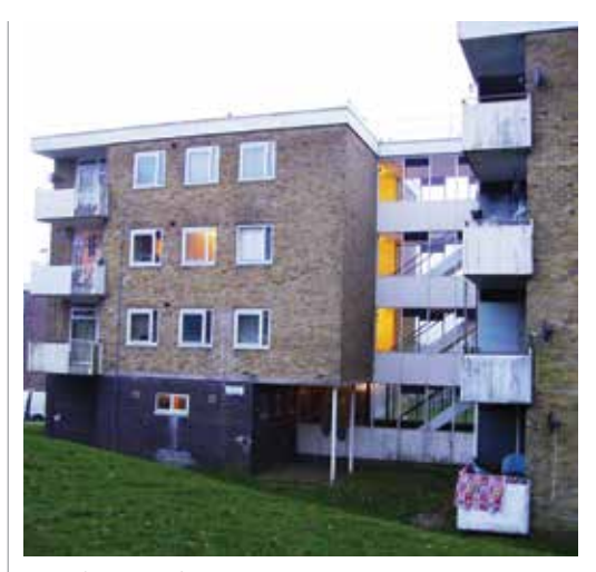
Figure 2. Thornhill, Southampton, UK.